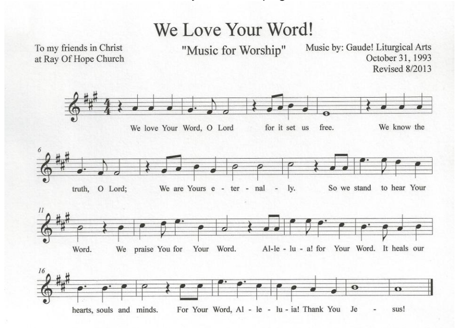
February 14, 2021 page: 10

©1993 by Gaude! Liturgical Arts. All Rights Reserved. International Copyright Secured. Reprinted here under CCLI#706121